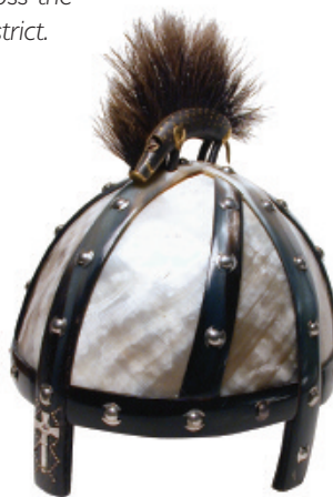
A reconstruction of the spectacular find of an Anglo-Saxon helmet from Benty Grange.