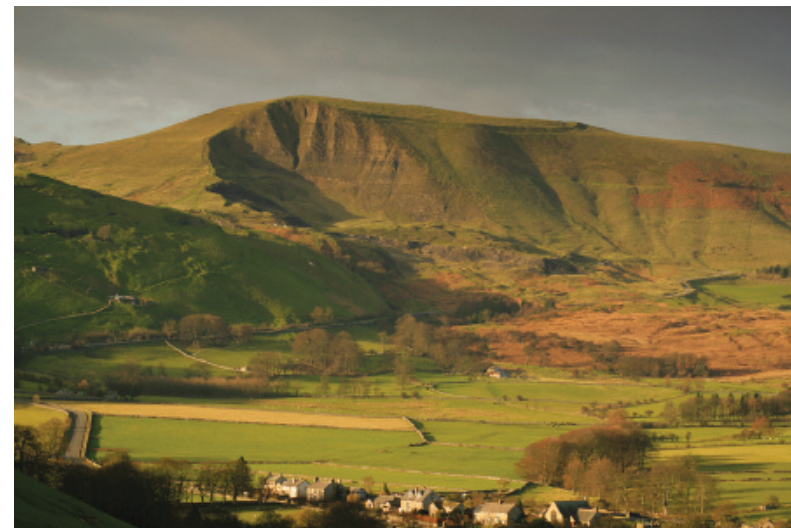
Mam Tor rises above the head of the Hope Valley. The prehistoric ramparts are so large they can be seen as lines ringing the hill from a distance.