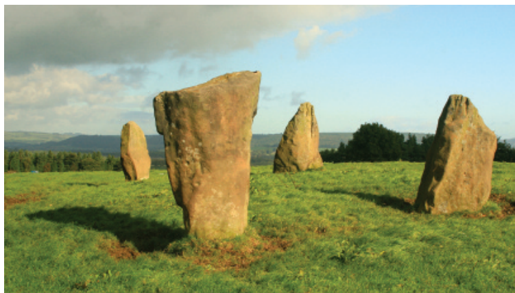
Nine Stone Close was built about 4000 years ago as a place for ceremonies.