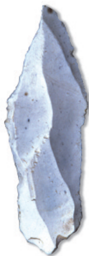
Stone tools such as this worked flint point have been found across the Peak District.