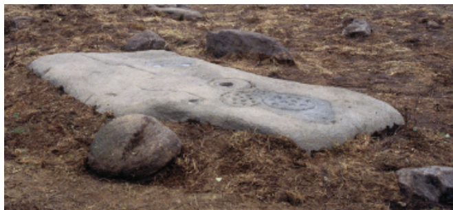
The distinctive prehistoric rock art on Gardom's Edge.